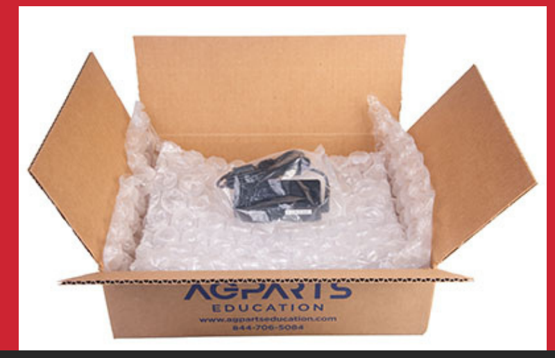
Step 2: Place adapter in original protective bag or bubble pouch on top of bubble.