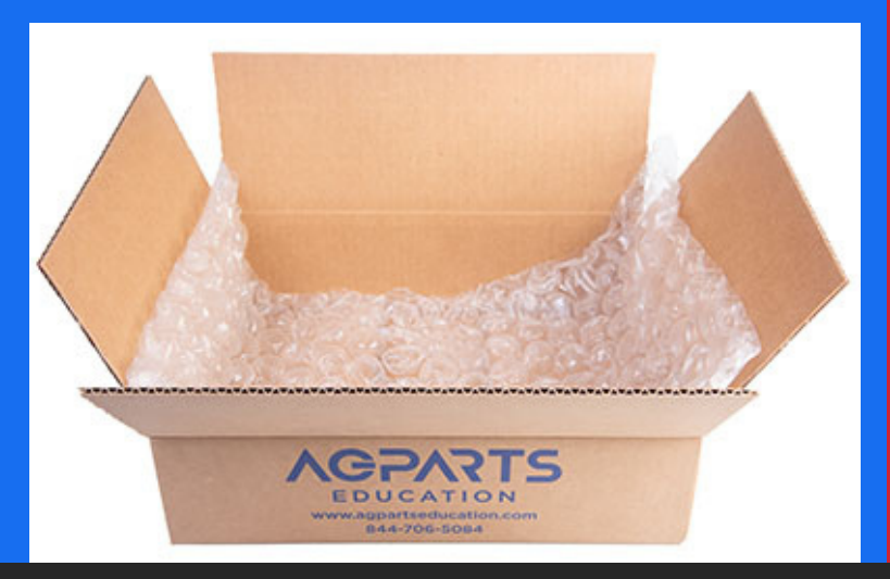
Step 1: Line bottom of the box with protective bubble.

To get started, you'll need a sturdy box, the return adapter in its original protective bag or bubble pouch, bubble wrap, and packing tape.