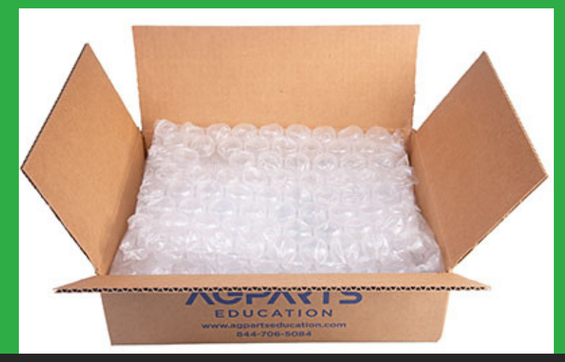
Step 3: Place bubble over adapter. Use enough bubble to prevent movement. If returning multiple adapters, secure each part in its original packaging or protective bubble.