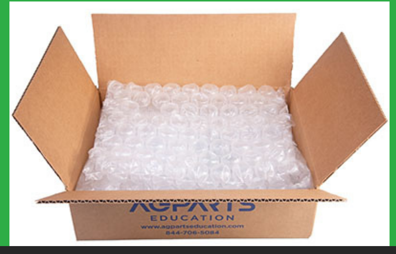
Step 3: Place bubble over part. Use enough bubble to prevent movement. If returning multiple boards, secure each board in a static bag.