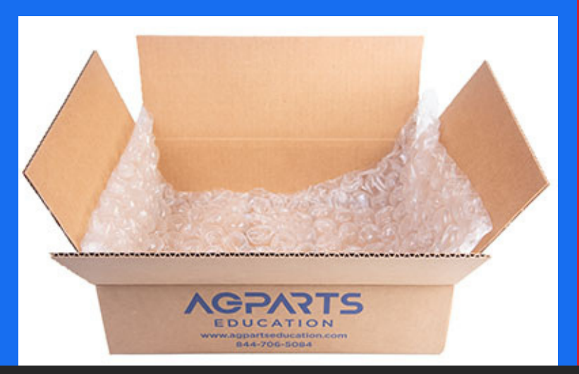
Step 1: Line bottom of the box with protective bubble.

To get started, you'll need a sturdy box, the return board enclosed in a static bag, bubble wrap, and packing tape.