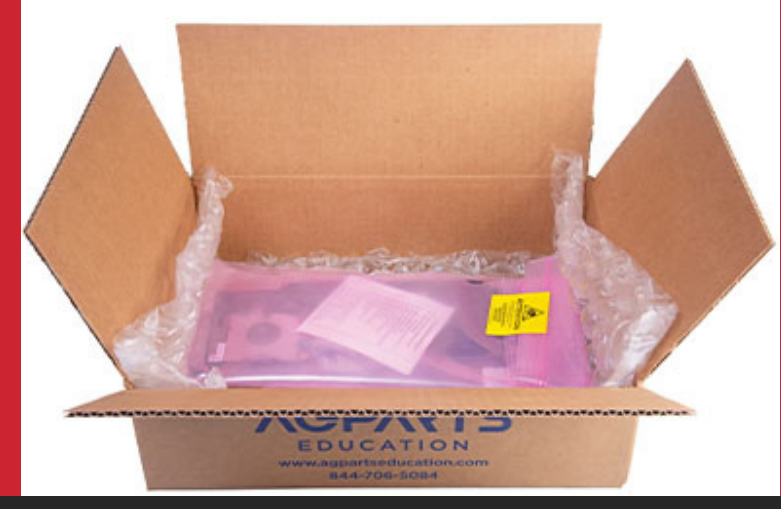
Step 2: Place board in static bag on top of protective bubble.