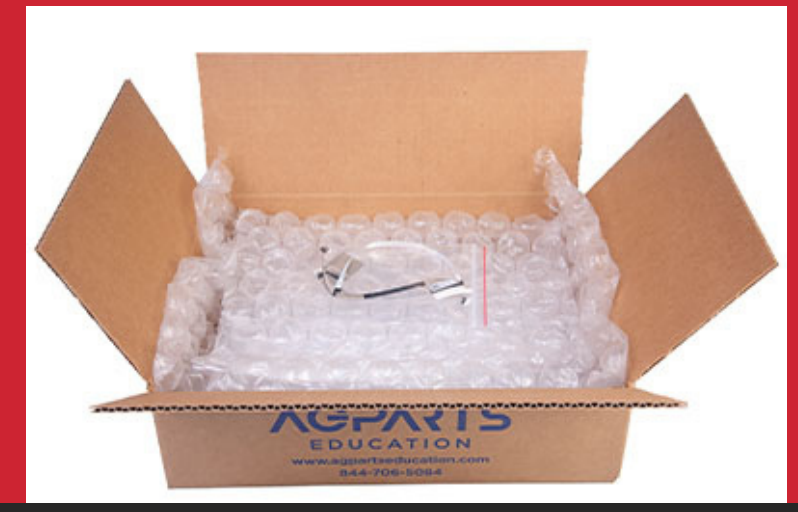
Step 2: Place cable in original protective bag or bubble pouch on top of bubble.