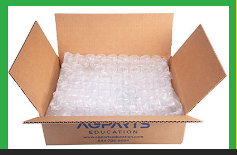
Step 3: Place bubble over part. Use enough bubble to prevent movement. If returning multiple parts, secure each part in its original packaging or protective bubble.