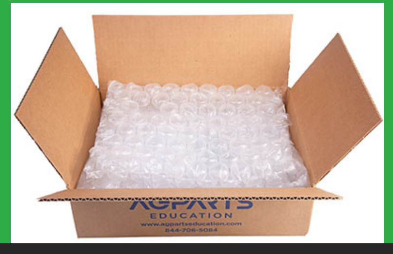
Step 3: Place bubble over LCD. Use enough bubble to prevent movement. If returning multiple LCDs, secure each part in its original packaging or protective bubble.