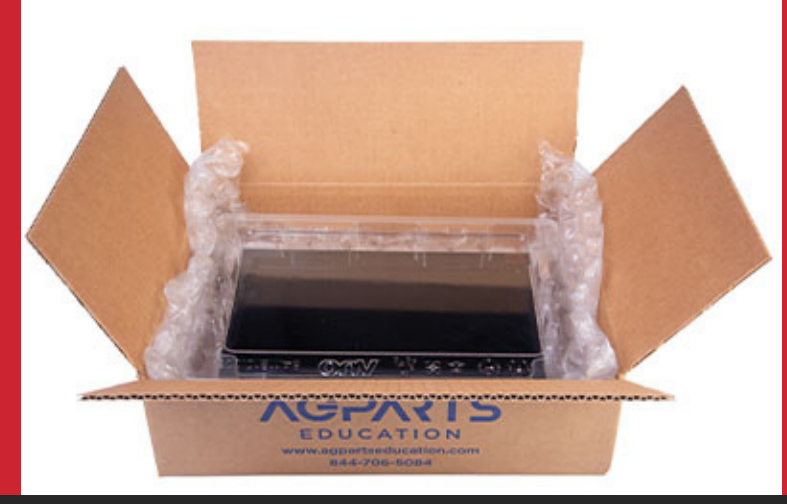
Step 2: Place LCD in original packaging or bubble pouch on top of bubble.