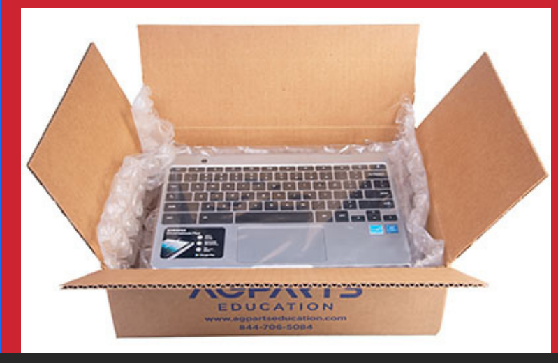
Step 2: Place part in original protective bag or bubble pouch on top of bubble.